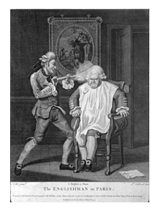
A "powder room" was an apartment where wigs were dressed.

Faulty derivations can also be found in such more serious works as Common Phrases and Where They Came From , published in 2001. It says eighteenth- and nineteenth-century phrases like "not giving a damn" and "not worth a damn" refer not to damnation but to a monetary unit in India that had little value. The Oxford English Dictionary says such an explanation is "ingenious but has no basis in fact." It dismisses the theory that the expression is a shortening of "don't give a tinker's damn," recorded in 1839 by Henry David Thoreau. A tinker's dam is a bowl of dough shaped by a tinker that keeps solder from running off his work area. The dough is used once and discarded, making it worthless. The notion that people observed this and then punned, "I don't give a tinker's dam," says the dictionary, is "baseless conjecture." The expression more likely arises from the propensity of tinkers, like sailors, to curse profusely, making their oaths too common to have power or effect.