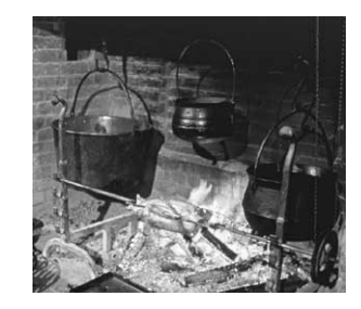
The iron pots hanging in the fireplace might with justice call the sooty copper kettle black, or little better than they.