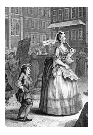
The small, slovenly man at left in this 1736 Hogarth print is abroad in his slippers, and thus "slipshod."

The Flavells say that "the mainly rural life of the times certainly means that agricultural expressions, phrases about the weather, etc. were more common than today. One might also say that the growth in shipping led to the introduction of various nautical expressions."