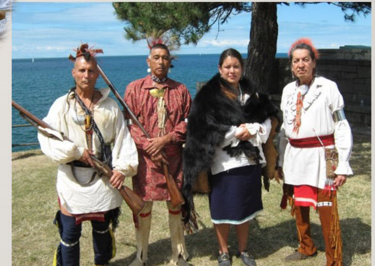
NATIVE CAMP AND INTERPRETATION OPPORTUNITIES.