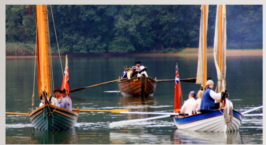
BOAT CAMP ON RIVER NEXT TO LAUNCH.

CAVALRY. BOATS. NATIVES. ARTILLERY. INFANTRY. LADIES. FAMILIES.